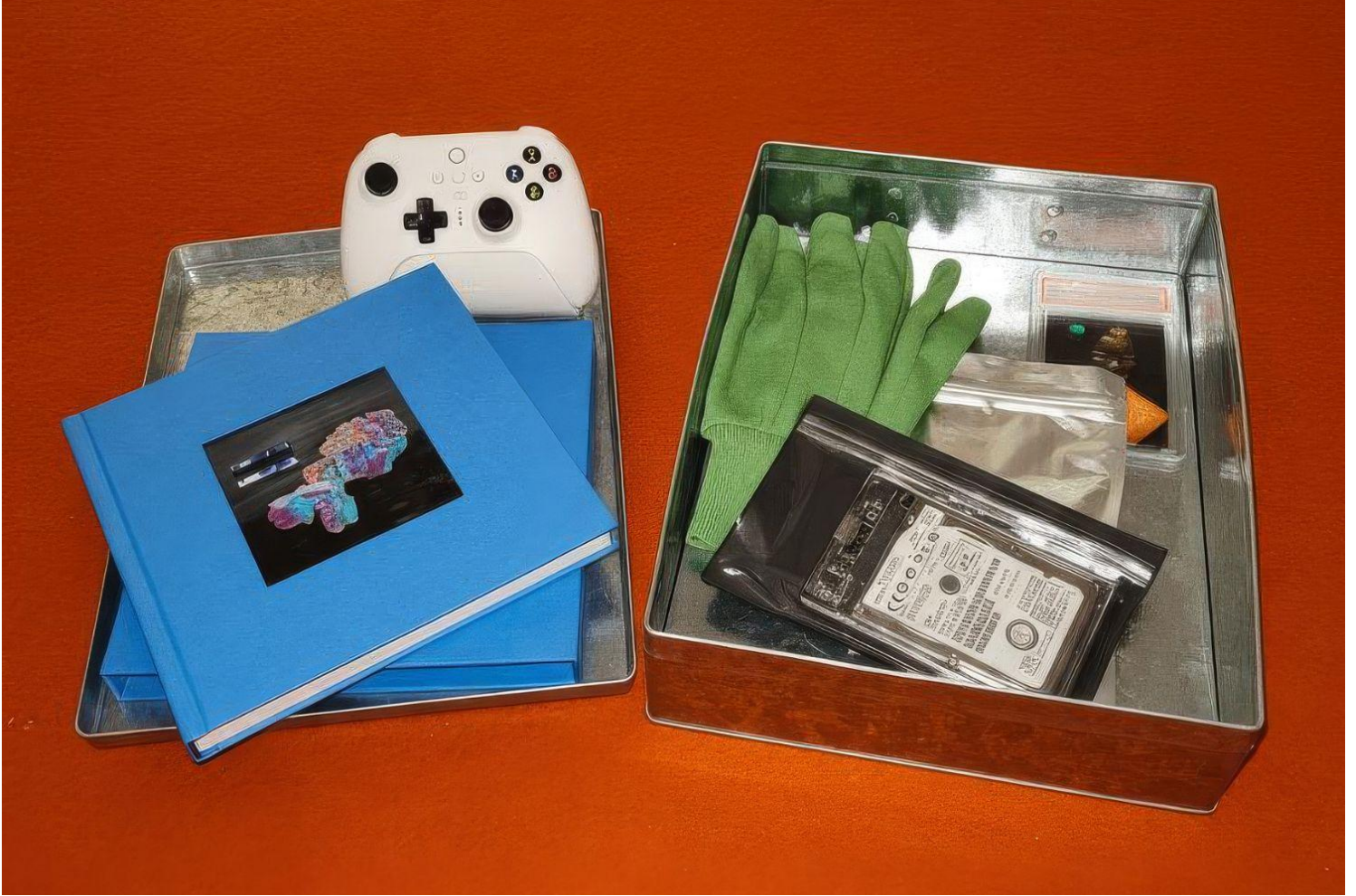
The City of Willows Box Set, Chong Yan Chuah, 2025