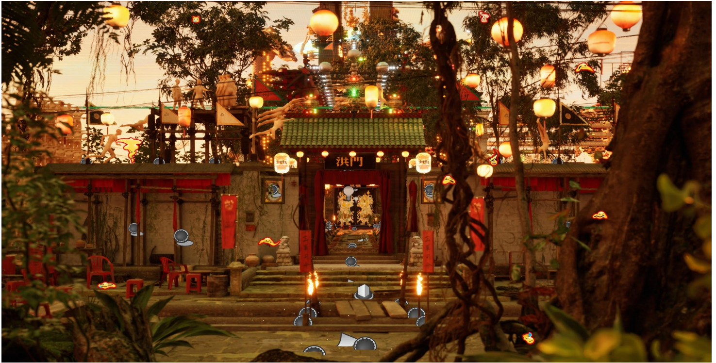
Screenshot from The City of Willows 2025